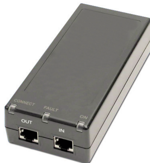
Power over Ethernet (PoE) Single Port Injector

A11-B32 CONNECTIONS-32 Programmer's Toolkit with ActiveX Controls: Write your own special software to control the digiBASE-E from LabView, Visual C++, or Visual Basic. List mode operations are available only using your own custom software.