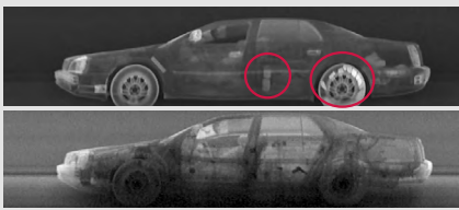
TOP: Right-side Z Backscatter view BOTTOM: Right-side Forwardscatter view