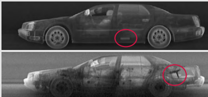
TOP: Left-side Z Backscatter view BOTTOM: Left-side Forwardscatter view