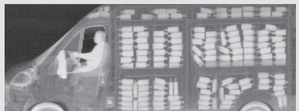
Image reveals smuggled alcohol, hidden to avoid paying duties