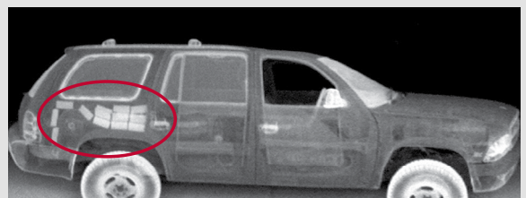
Image shows hidden narcotics