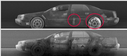
TOP: Right-side Z Backscatter view BOTTOM: Right-side Forwardscatter view