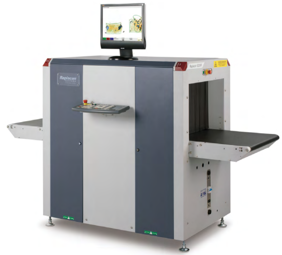
TUNNEL OPENING (WXH): 620 X 420 MM (24.4 X 16.5 IN)

THE RAPISCAN 620XR PROVIDES OUTSTANDING THREAT DETECTION AND A LOW TOTAL COST OF OWNERSHIP. The 620XR's innovative design allows for bi-directional operation, while ergonomic options such as its adjustable control panel stand make it easy to operate.