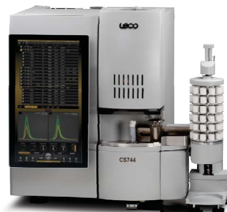
CS744 with optional autoloader