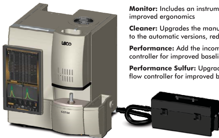
CS744 with high-velocity vacuum system

Performance Sulfur: Upgrades the standard flow controller with a thermally stabilized flow controller for improved baseline stability and precision