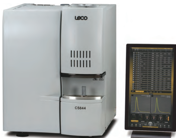
Shown with stand-alone touch-screen monitor.