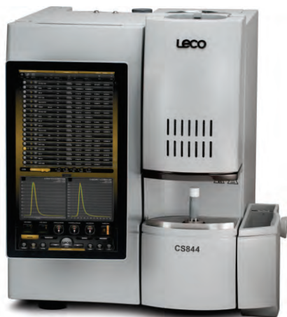
Shown with touch-screen monitor.