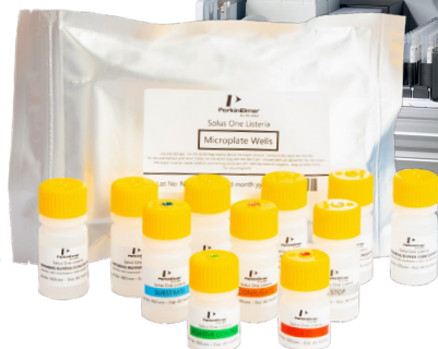
Solus One Listeria Assay and Automated Workflow Package