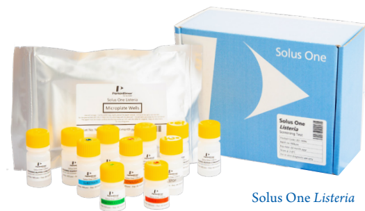
Solus One Listeria

Solus pathogen tests are manufactured in our own production facility to the highest standards, which are tightly controlled within our ISO 9001-accredited quality system.