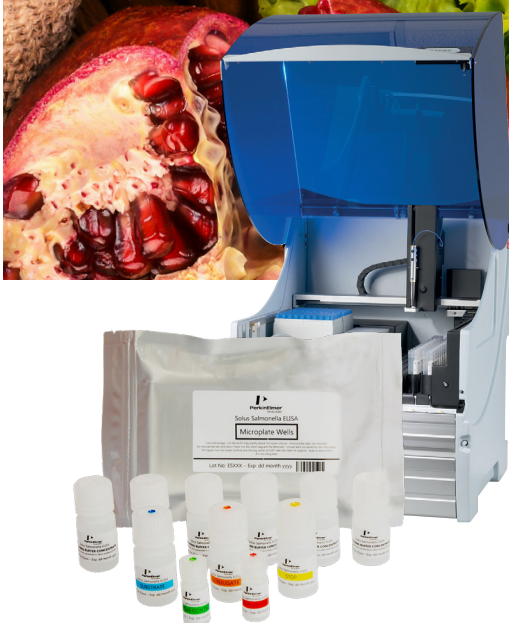
Solus Salmonella ELISA Assay and Automated Workflow Package