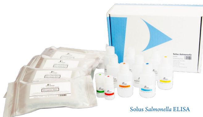
Solus Salmonella ELISA

Our test system is perfect for labs looking to achieve higher sample throughput, improved laboratory workflow, reduced technician time, and increased capacity for testing.