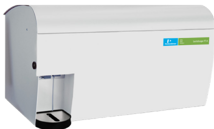
LactoScope™ Milk and Dairy Products Analyzer